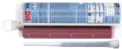
Cartridge VME basic 585 Side-by-side cartridge Content: 585 ml