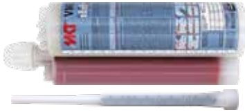
Cartridge VME basic 440 Side-by-side cartridge Content: 440 ml